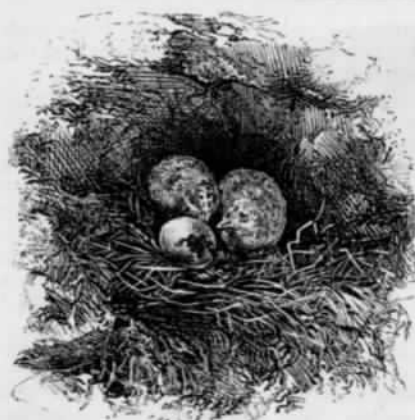
THE GULL'S NEST.

jured, could he have watched this thousand or two of sea-lions at their sports.